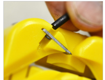
Fixed stainless steel blades require no adjustments and replace easily.

For more information or to locate the nearest authorized Ripley® distributor, please visit www.ripley-tools.com or call 1 (800) 528-8665 to speak to a customer service representative.